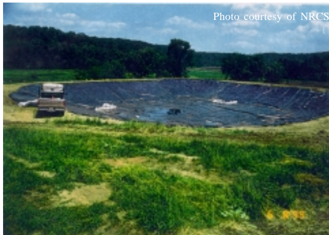
Construction of Agricultural waste storage facility

To ensure the future protection of water quality, the farm waste management system needs to be regularly inspected and maintained. It is expected that the dairy farm (with the assistance of local conservation organizations) will continue to take measures necessary to protect water quality in Sucker Brook and Lake Waramaug by following through with a new operation and maintenance plan established for the farm. The Lake Waramaug Task Force and local health departments will continue monitoring the lake and its feeder streams to determine whether the farm waste management system and other best management practices are working to maintain and improve water quality. A task force member stated in a recent local newspaper article that, "This is a success story, but it wouldn't take much to turn it around. There has to be constant monitoring; constant improvement. Everything has to be kept working, brought up to date....." (The New Milford Times , July 21, 2000).