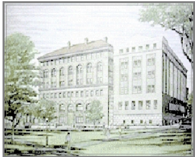
Connecticut Department of Environmental Protection Bureau of Water Management, Planning & Standards Division Nonpoint Source Management 79 Elm Street, Hartford, CT 06106-5127 (860) 424-3020

This CT DEP NPS Success Story is funded by the CT DEP through a US EPA Clean Water Act Section 319 Nonpoint Source Grant.