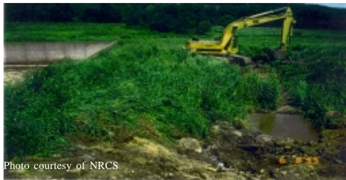
Settling area adjacent to manure storage facility during construction

Conservation District (LCSWCD) and USDA Natural Resources Conservation Service (NRCS) to plan, design, and build a farm waste management system. The task force raised private funds, and through the conservation district, also solicited financial assistance from the towns that border the lake, and the Connecticut Department of Environmental Protection (CT DEP). The CT DEP subsequently applied for and received Section 319 funds from the U.S. Environmental Protection Agency (US EPA). The farmer applied for funds through the USDA Farm Services Agency and the CT Department of Agriculture and a loan from the Lake Waramaug Task Force.